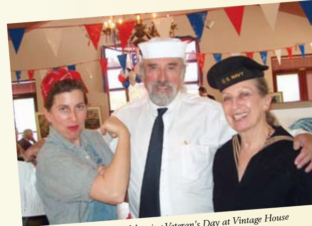
Celebrating Veteran's Day at Vintage House