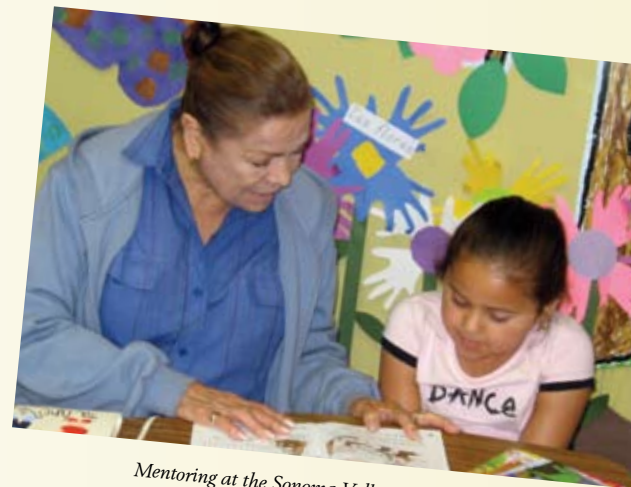
Mentoring at the Sonoma Valley Education Foundation

Sonoma Community Center – for an exhibition of 100 photographs of “Life in the Springs”.